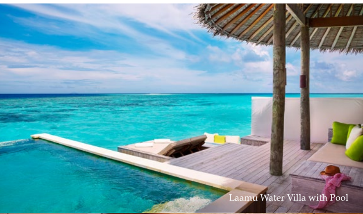
Laamu Water Villa with Pool