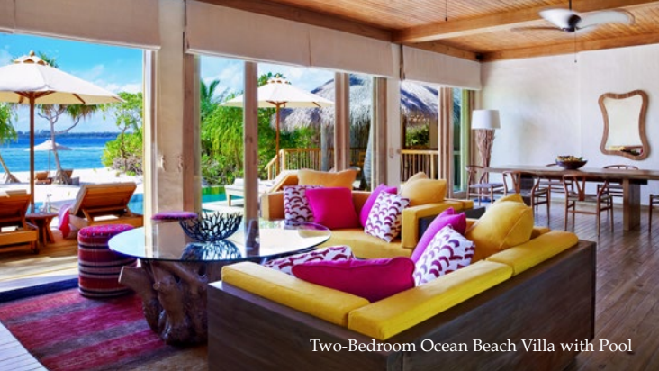
Two-Bedroom Ocean Beach Villa with Pool