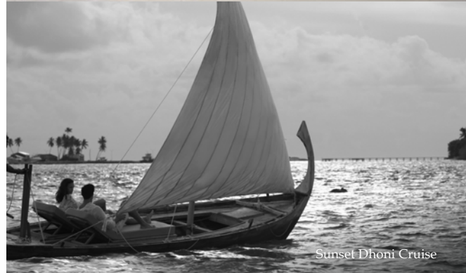
Sunset Dhoni Cruise