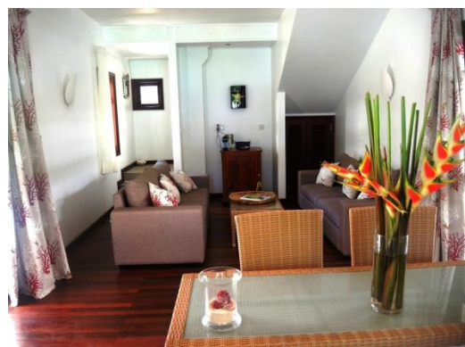
Villa Anne Dieu Le Veut - Lounge