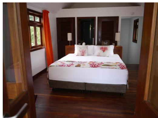
Villa Anne Dieu Le Veut