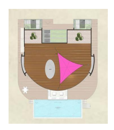
Roof deck plan