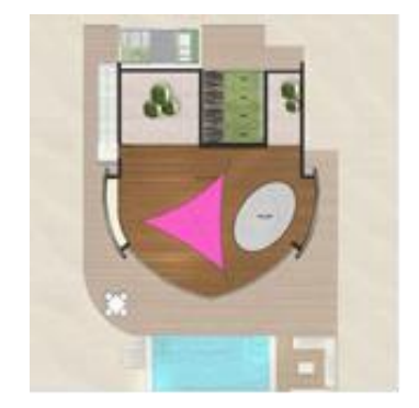
Roof deck plan