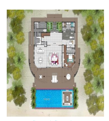
Ground\ floor\, plan

LUX* Beach Retreat and LUX* Overwater Retreat