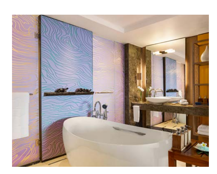
Frangipani Club Junior Suite - Bathroom