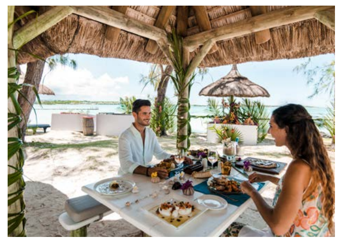
Ilot Mangénie Beach Club