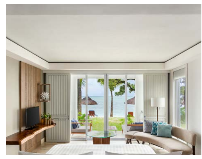
Frangipani Club Junior Suite Beach Access