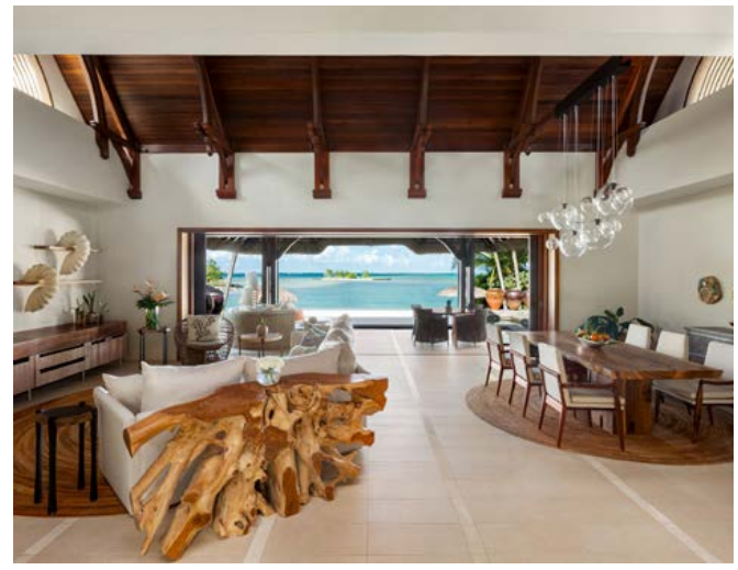
Shangri-La Three Bedroom Beach Villa - Living Room