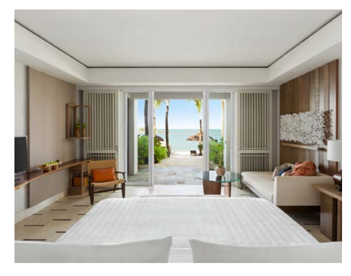
Hibiscus Junior Suite Beach Access