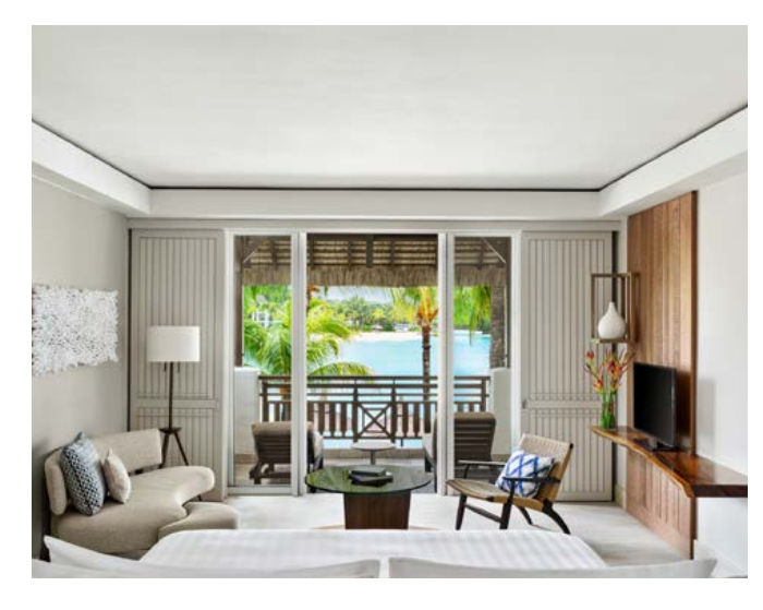
Frangipani Club One Bedroom Suite Ocean View - Bedroom