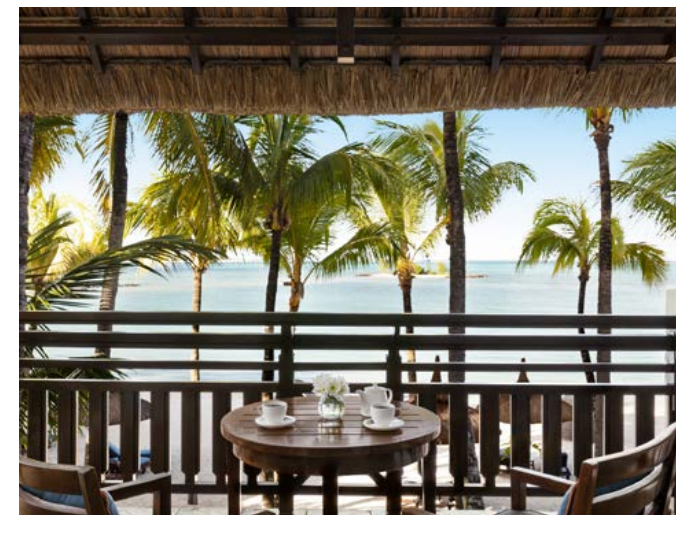
Hibiscus Family Suite Ocean View - Terrace