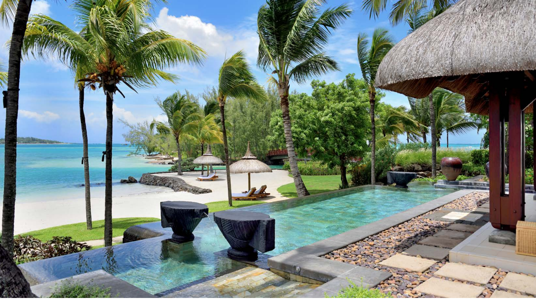
Shangri-La Three Bedroom Beach Villa