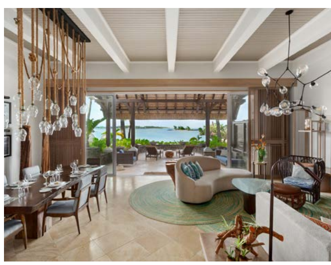
Shangri-La One Bedroom Suite - Living Room