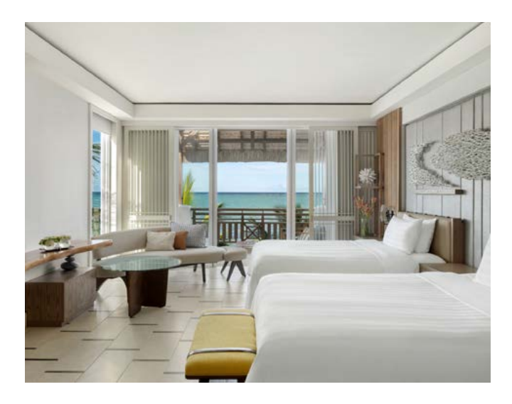
Frangipani Club Family Suite Ocean View - two interconnecting suites