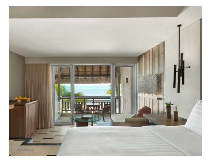
Coral Deluxe Room Ocean View