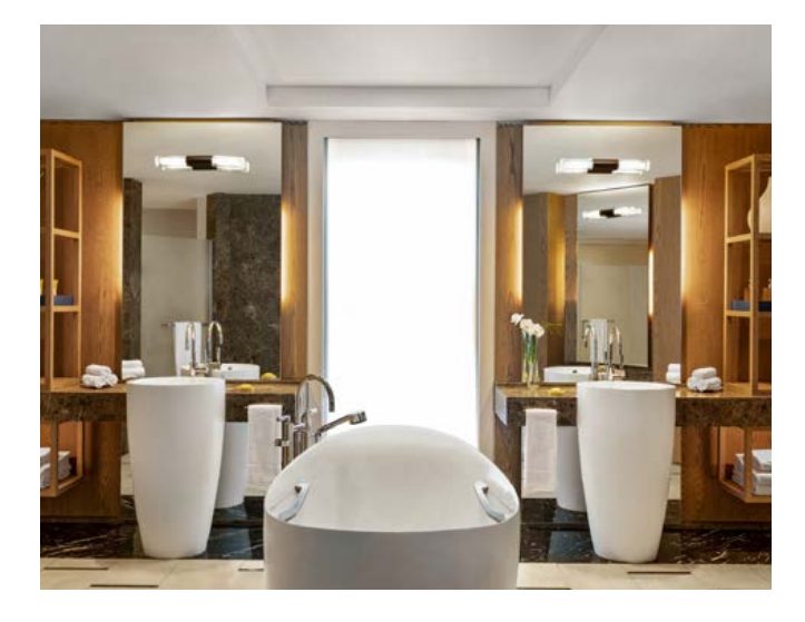
Frangipani Club One Bedroom Suite Ocean View - Bathroom