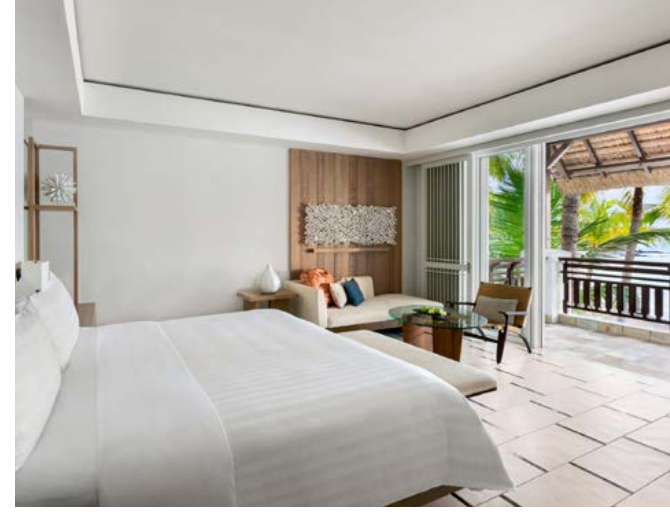
Hibiscus Junior Suite Ocean View