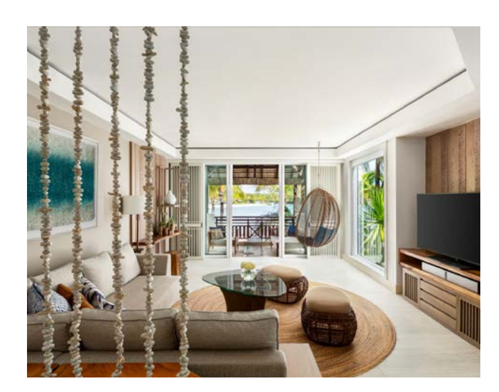
Frangipani Club Two Bedroom Family Suite - Living Room