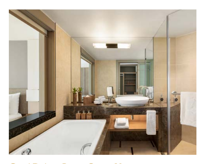
Coral Deluxe Room Ocean View or Beach Access - Bathroom