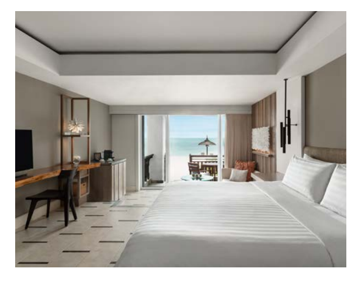
Coral Deluxe Family Room - two interconnecting rooms Ocean View or Beach Access