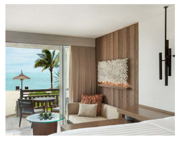
Coral Deluxe Room Beach Access