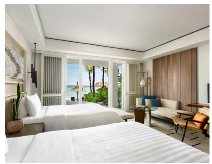
Hibiscus Family Suite - two interconnecting suites Ocean View or Beach Access