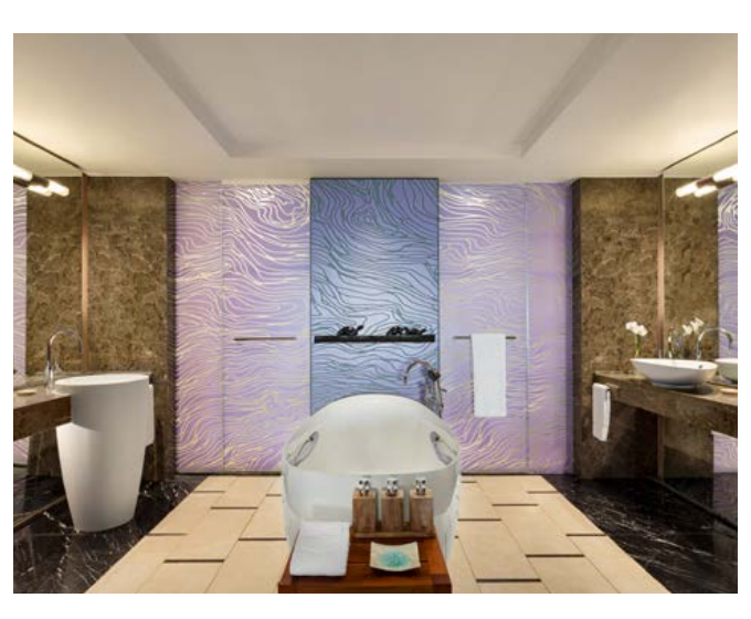
Frangipani Club Family Suite Ocean View - Bathroom