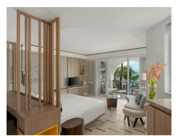
Frangipani Club Junior Suite Ocean View