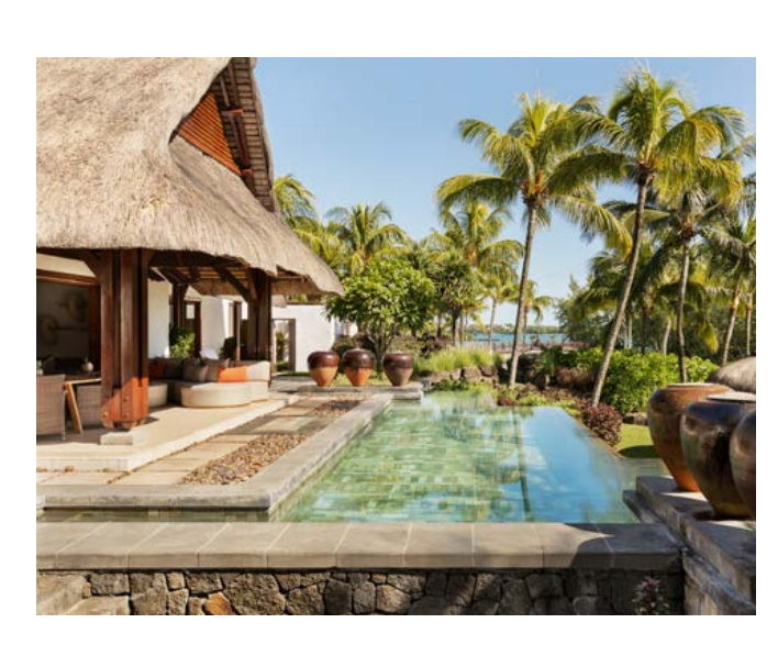
Shangri-La Three Bedroom Beach Villa - Terrace