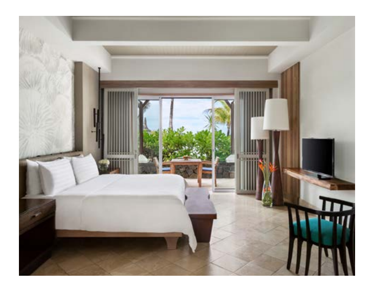
Shangri-La One Bedroom Suite - Bedroom