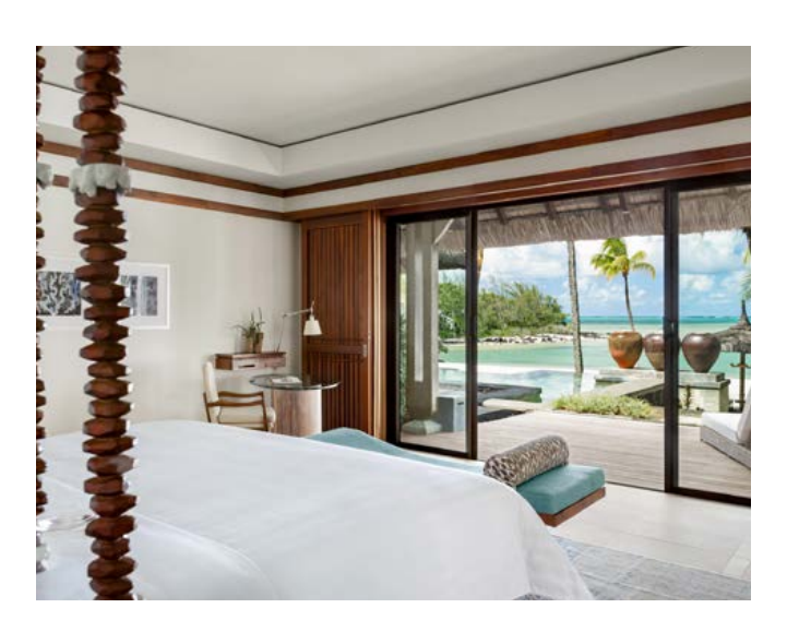
Shangri-La Three Bedroom Beach Villa - Bedroom