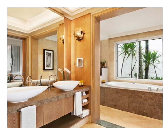
Shangri-La One Bedroom Suite - Bathroom