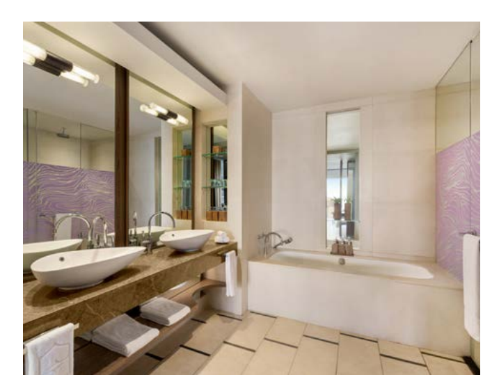
Hibiscus Junior Suite - Bathroom