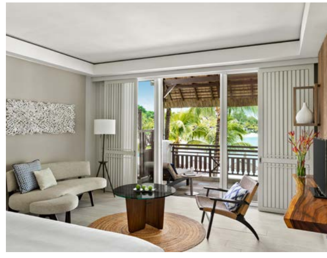
Frangipani Club Two Bedroom Family Suite - (two interconnecting suites)