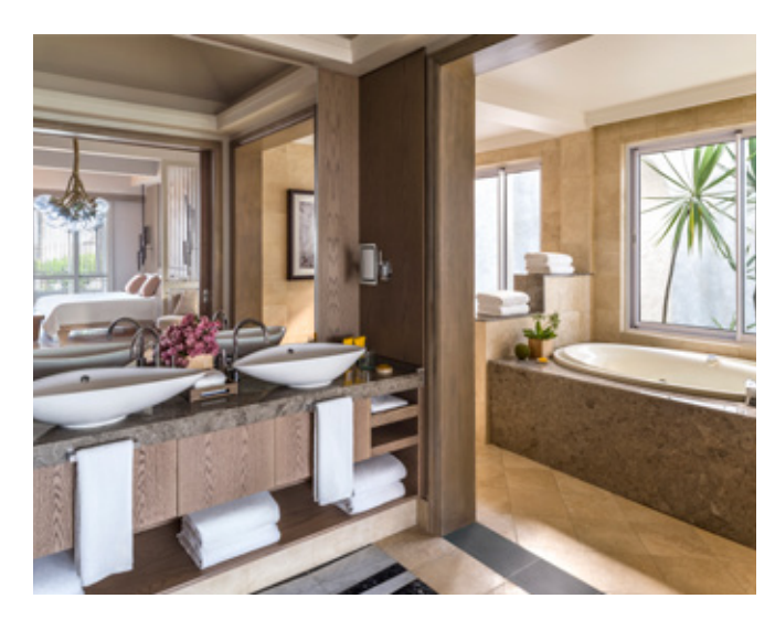
Shangri-La One-Bedroom Suite - Bathroom