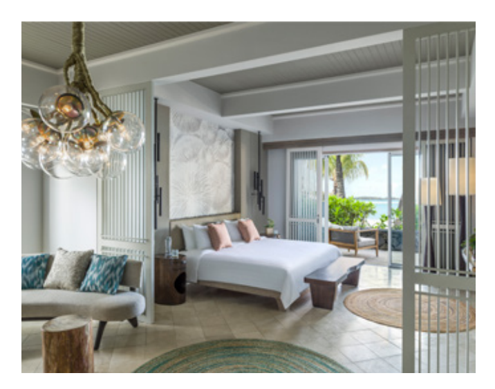
Shangri-La One-Bedroom Suite - Bedroom