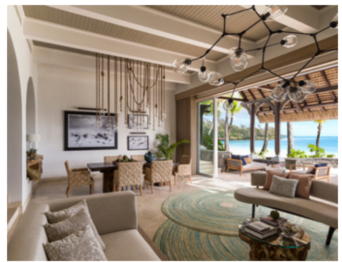
Shangri-La One-Bedroom Suite - Living Area