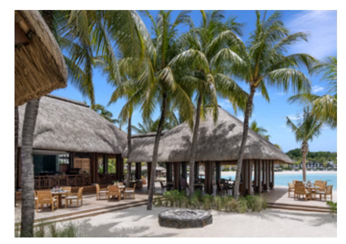
Republik Beach Club & Grill