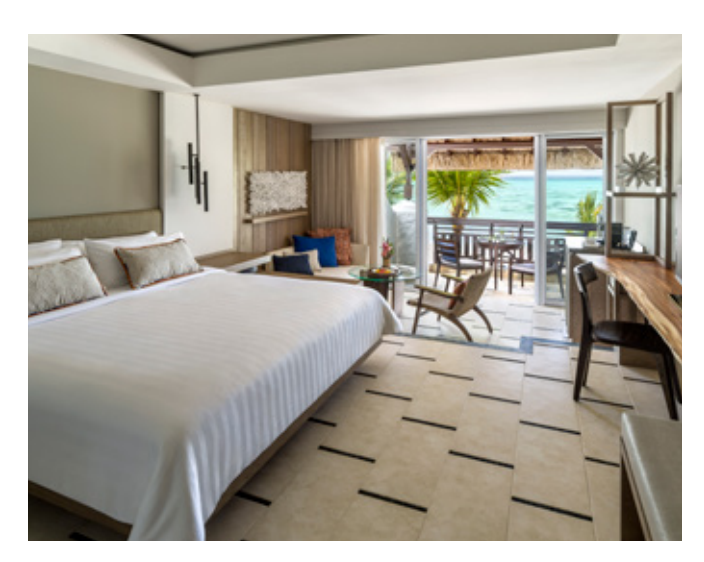
Coral Deluxe Room Ocean View