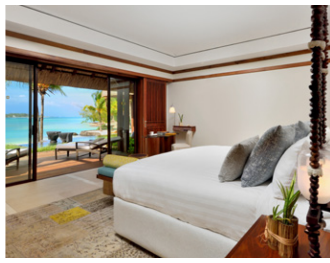
Shangri-La Three-Bedroom Beach Villa - Bedroom