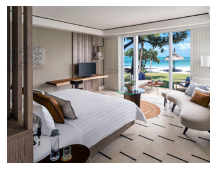
Junior Suite Frangipani Club Beach Access