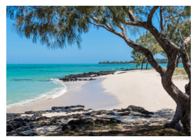
Ilot Mangénie Beach Club