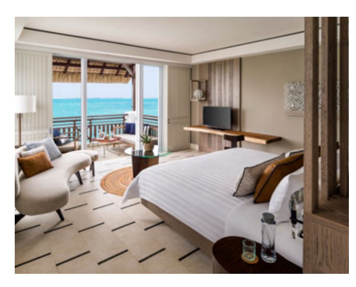
Junior Suite Frangipani Club Ocean View