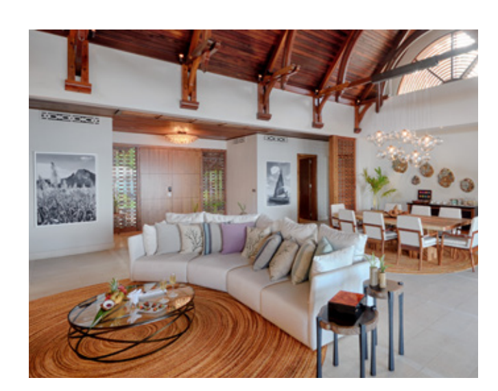
Shangri-La Three-Bedroom Beach Villa - Living room