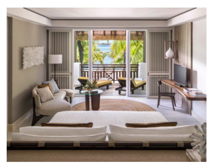
Frangipani One-Bedroom Suite - Bedroom