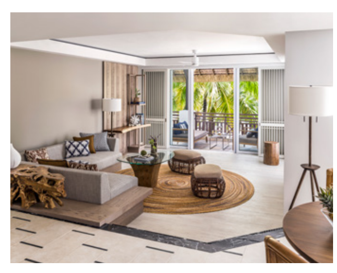
Frangipani One-Bedroom Suite - Living Room