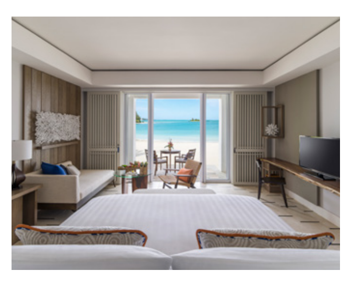
Junior Suite Hibiscus Beach Access