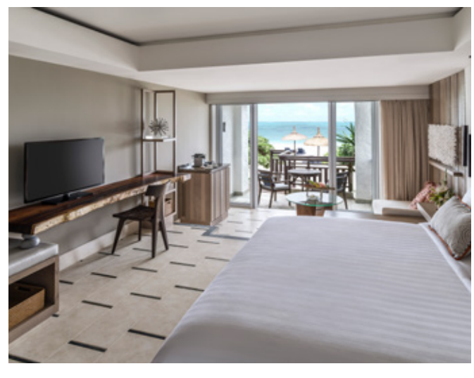
Coral Deluxe Room Beach Access