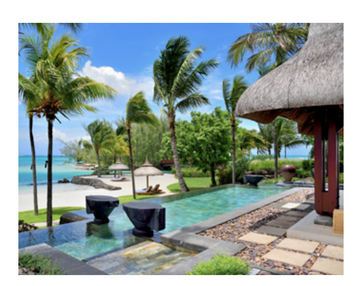
Shangri-La Three-Bedroom Beach Villa - Terrace