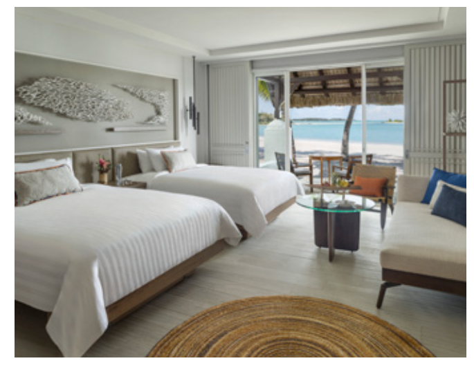
Junior Suite Hibiscus Beach Access - Twin